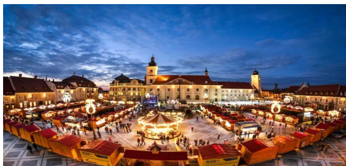
Sibiu's enchanting Christmas market!

The ECLSO Congress promises us an excellent scientific programme for with a multitude of networking opportunities.